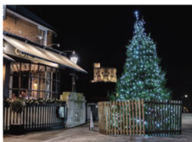
Côte Brasserie Windsor