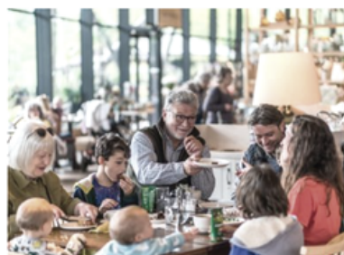
The Savill Garden Kitchen